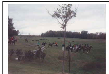
ON THE HUNT (KATINKA IS CIRCLED)

through snow, riding/swimming across a pond, or races and steady hands at fun day activities. She did it all and willingly!!