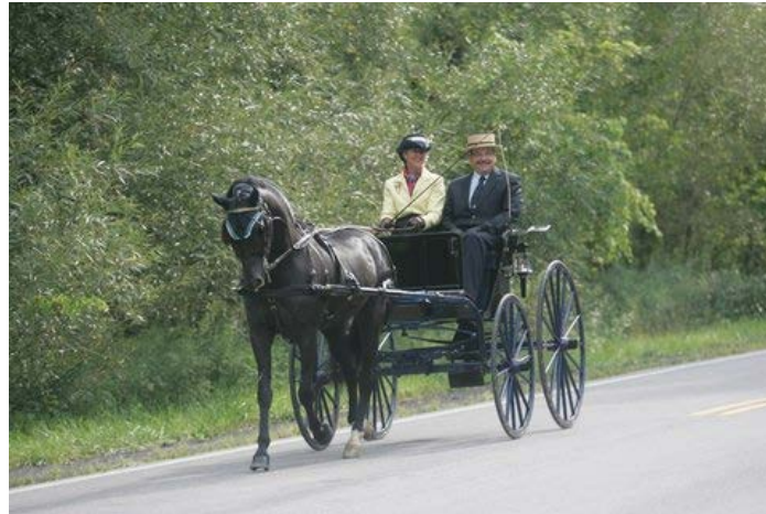
June 16, 1998 – July 27, 2017